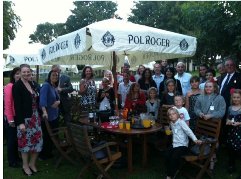
Colts & Fillies Club members at Sandown Park to watch Safari Team run