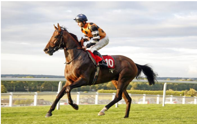
Safari Team in action at Sandown Park on 4 th August